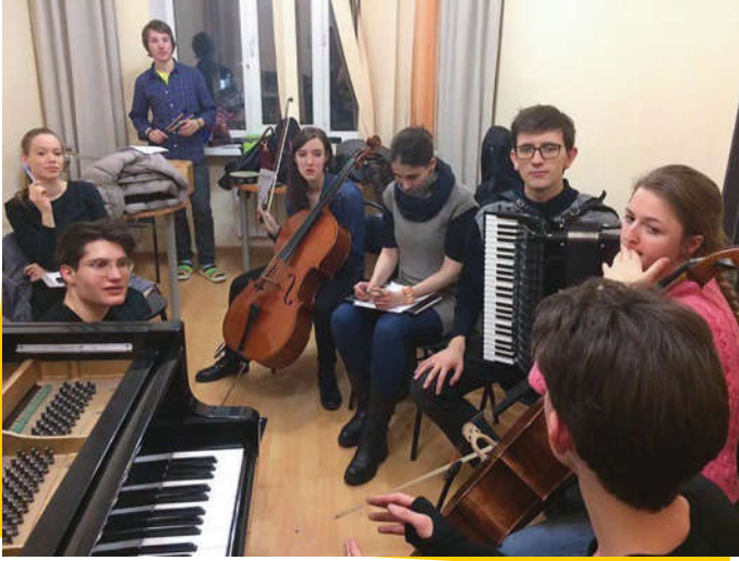
▲ The students of Gnesin Academy of Music