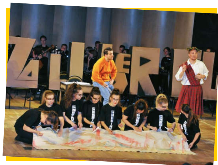
▲ The Russia-Austria Year of Music

+7 963 717-15-98 (WhatsApp, Wechat) inpodotdel@gnesin-academy.ru