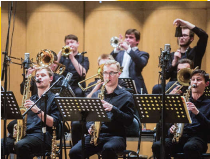
▲ Academic Band Jazz Orchestra