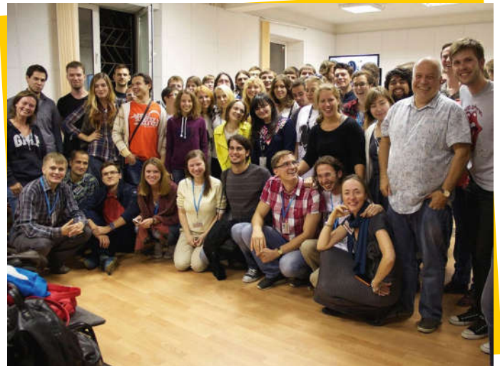
▲ Gnesin Contemporary Music Week (the festival laboratory of contemporary music)