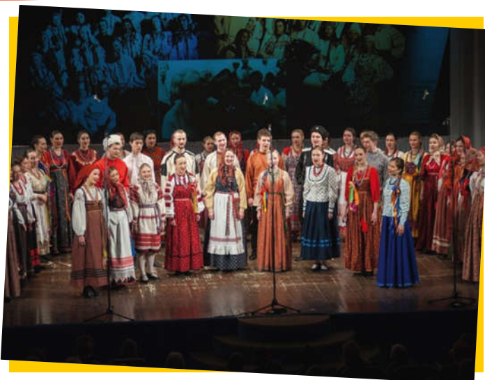
▲ The Folk Choir (full-time department) of Gnesin Russian Academy of Music

As part of the two international platforms: Erasmus+ and the Young Talent Support Program of the Embassy of Italy, the Academy's opera studio prepared and co-produced a performance of La Traviata opera by G. Verdi with the participation of two Italian conservatories – Arrigo Boito Conservatory of Parma and the Maggio Musicale Academy of Opera Singers (Florence).