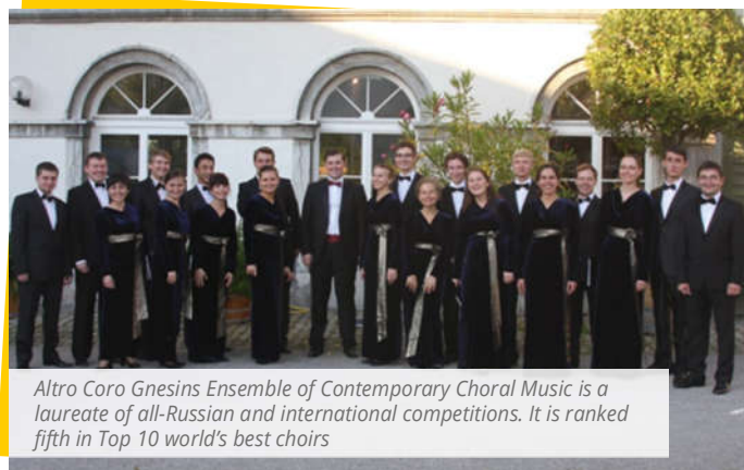
Altro Coro Gnesins Ensemble of Contemporary Choral Music is a laureate of all-Russian and international competitions. It is ranked fifth in Top 10 world's best choirs