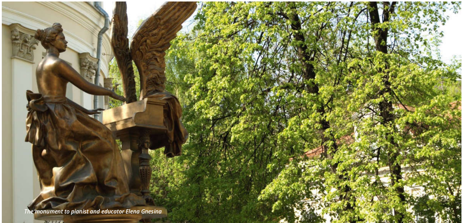
The monument to pianist and educator Elena Gnesina