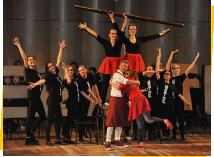
▲ A scene from The Magic Flute opera by W.A. Mozart (Department of Opera)