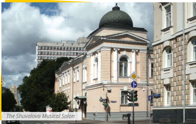
The Shuvalova Musical Salon